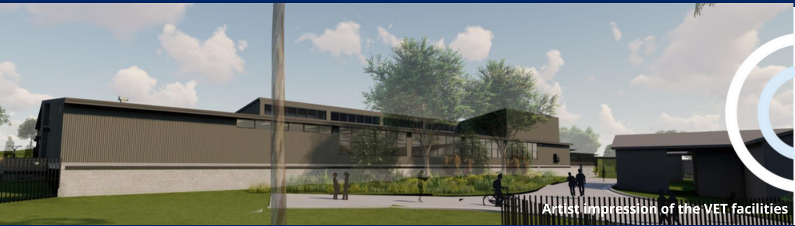
Artist impression of the VET facilities